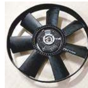
Electronic viscous fan