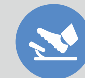
Harsh Acceleration, Braking and Cornering Detection