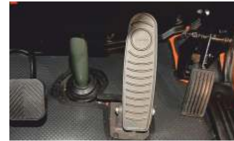
Pendant type Accelerator and Clutch pedal for fatigueless driving