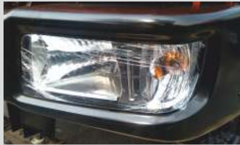
Clear lens wraparound headlamp for superior visibility coupled with chic styling