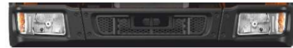
3 piece bumper | Ease of reparability due to modular design

Images are for representation purpose only