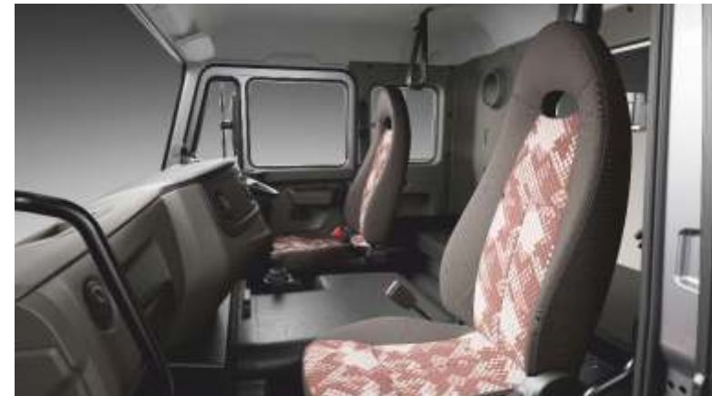
Premium interior aesthetics for superior in-cab driving experience