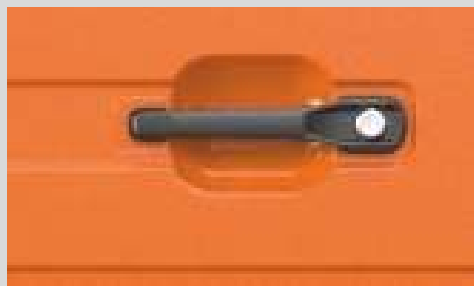
Single locking system for entire vehicle