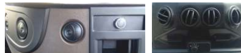
Truck ventilation system