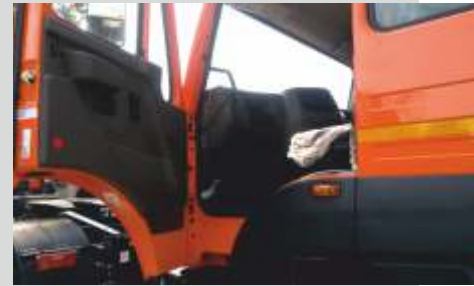
Both side grab handle and wider door angle or easy ingress/egress