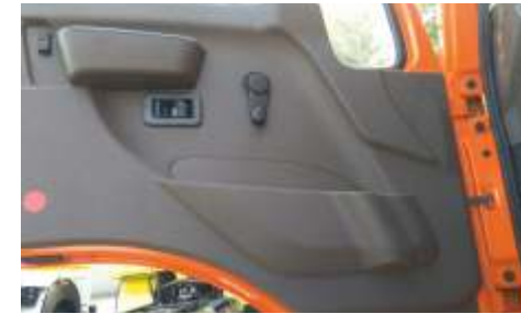
Magazine pocket and bottle holder