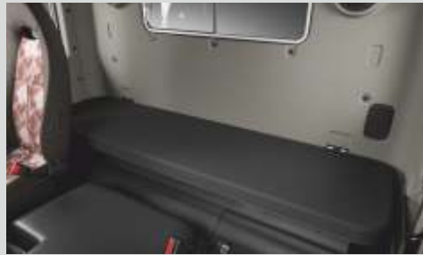
Wide and comfortable sleeper berth with spacious berth box