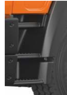
Lowest step-in height with three step footstep and scuff plate