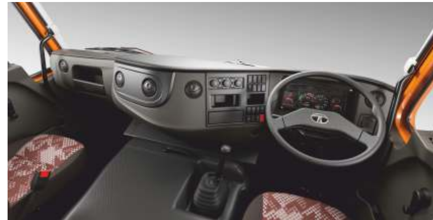
Easy accessibility of controls, comfy and expedient driveability