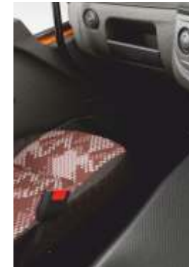
Lockable glove box beneath co-driver seat