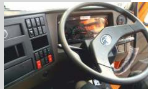
Ergonomic steering wheel