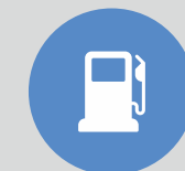
Fuel Consumption & DEF Monitoring