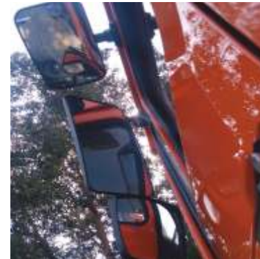
Side close proximity mirror Normal rear view mirror Wide angle rear view mirror