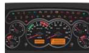
Ergonomic dashboard design with advanced Instrument Cluster and Telltale Lamps