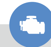
Engine Idling Monitoring