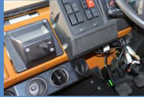
Truck Ventilation system