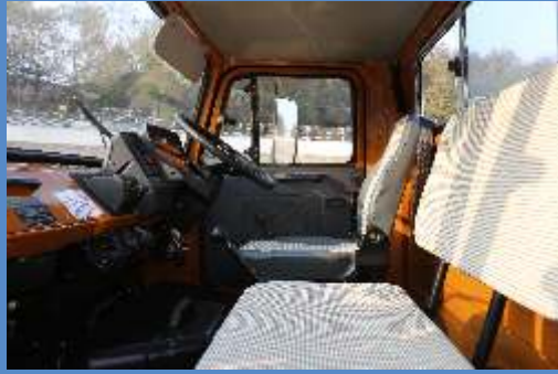
Driver Bucket Seat and Co-driver Bench Seat